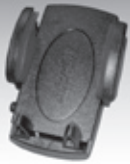
UNIVERSAL PHONE HOLDER

Specifications subject to change without notice